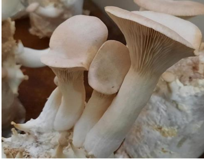
Cultivation of king oyster mushroom