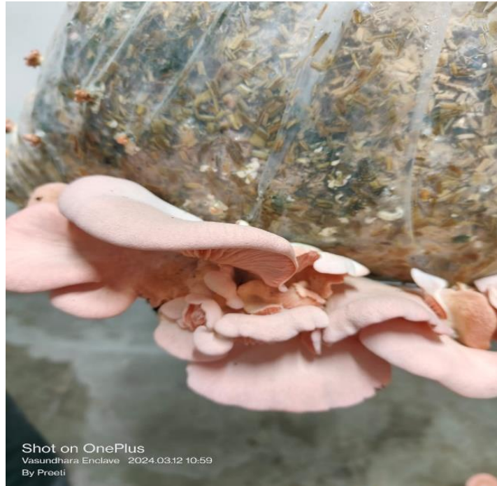
Cultivation of oyster mushroom