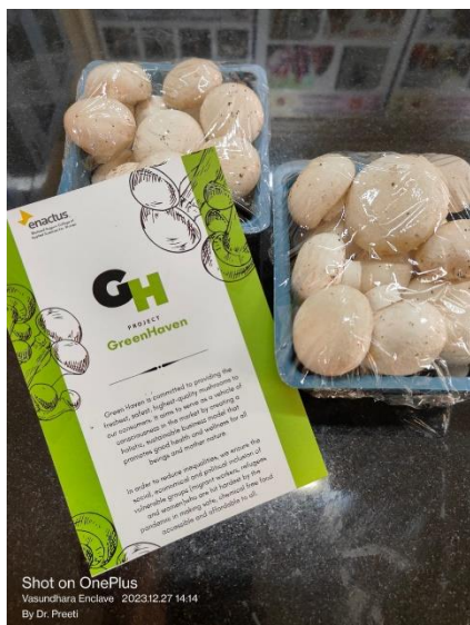
Cultivation of button mushroom